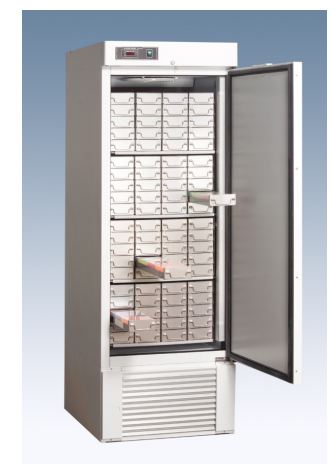
LabMed LM 6025WN