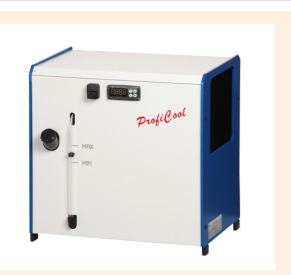
ProfiCool Minimus PCMin