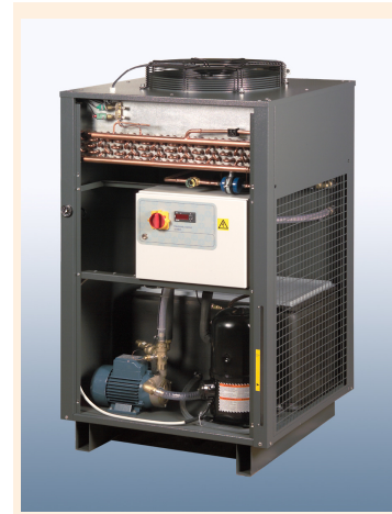
ProfiCool Genius PCGE