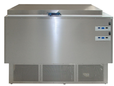
ProfiTest PTC (Special version with 2 separate cooling circuits)

ProfiTest chest freezers are manufactured according to customers' requirements. Therefore the following chart of some models does not show any temperature range. Dimensions are examples only.