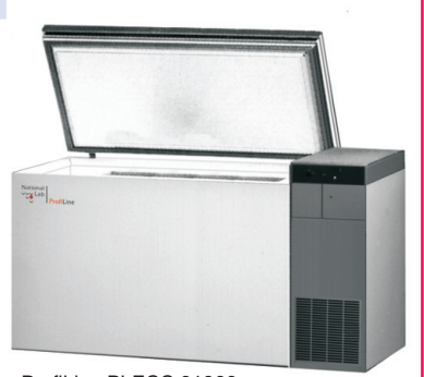
ProfiLine PLECC 31866