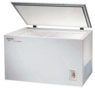
ProfiLine Pollux 3645WN